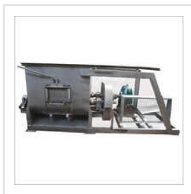
Mild Steel Detergent Soap Mixer Machine