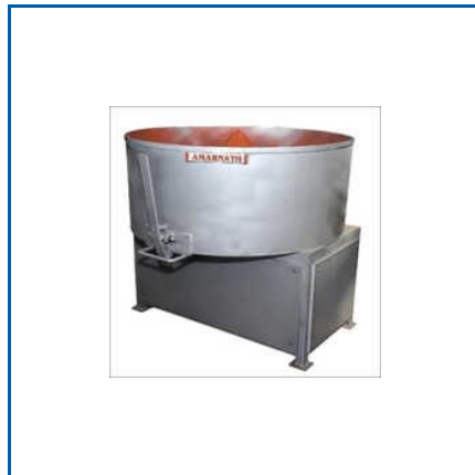
INDUSTRIAL DETERGENT POWDER MIXER MACHINE