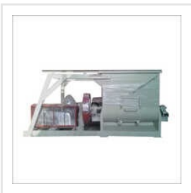
High Tech Detergent Mixer Machine