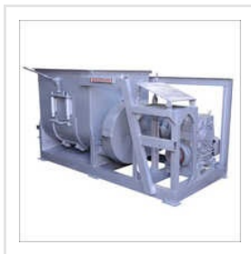
Toilet Soap Mixer Making Machine