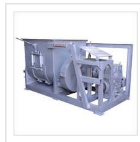
Mild Steel Detergent Mixture Machine