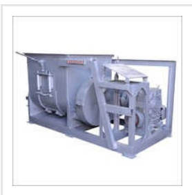
Three Phase Detergent Mixture Machine