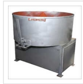
Washing Powder Mixture Machine