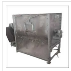
3 Phase Industrial Detergent Mixer