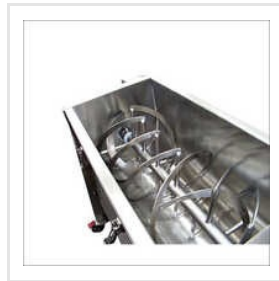
Stainless Steel Detergent Ribbon Mixer