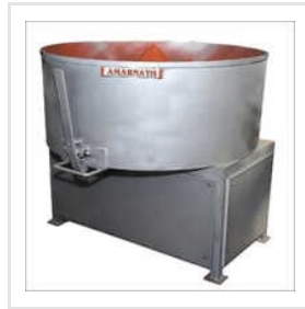
Industrial Detergent Powder Mixer Machine