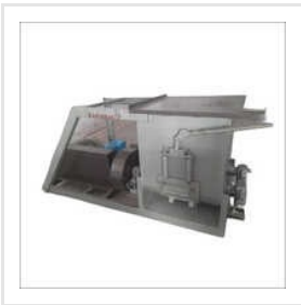
Mild Steel Sigma Detergent Mixture