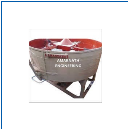
AUTOMATIC DETERGENT POWDER MIXER MACHINE

3 Phase Automatic Toilet Soap Making Machine, 3 Phase Cosmetic Soap Making Machine, 3 Phase Detergent Soap Machine, 3 Phase Industrial Detergent Mixer Machine, 3 Phase Manual Toilet Soap Plant, 3 Phase Toilet Soap Making Plant, Automatic Bath Soap Cutting Machine, Automatic Detergent Mixer Machine, Automatic Detergent Powder Mixer Machine, Automatic Duplex Vacuum Plodder Machine, Detergent Soap Automatic Cutting Machine, Fully Automatic Pneumatic Soap Cutting Machine, High Tech Detergent Mixer Machine, Industrial Detergent Powder Mixer Machine, Industrial Duplex Vacuum Plodder Machine, etc.