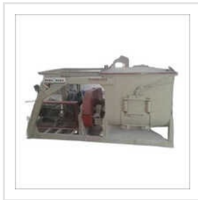
Automatic Detergent Mixer Machine