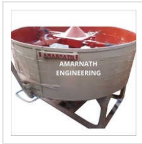
Automatic Detergent Powder Mixer Machine