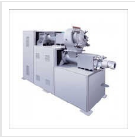
3 Phase Cosmetic Soap Making Machine