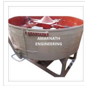
Stainless Steel Washing Powder