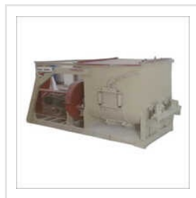
Mild Steel Detergent Cake Mixer Machine